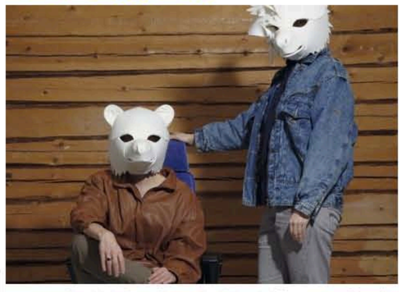
The artistic duo Benten Clay currently exhibiting at Loris

From Art & Toys (thousands of them!) to 100 years of Berlin Kunst, we bring you the best art shows from around the city on the last day of Berlin Art Week!